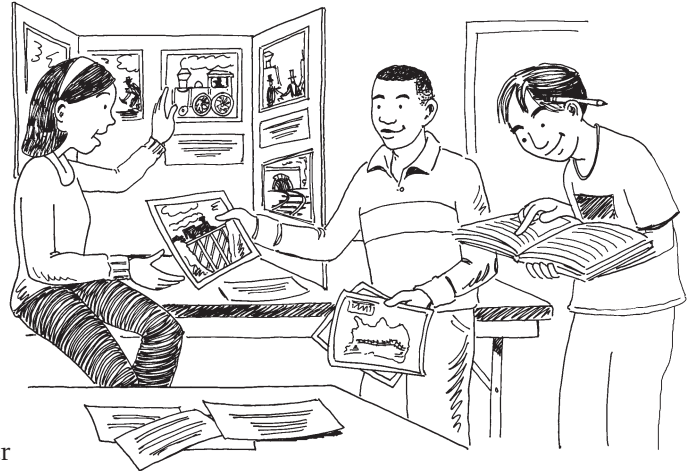
Chart your course

Share with your teen these steps for working effectively in groups.